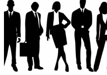
New Officers Ready