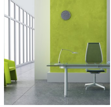
Free Convention Package!